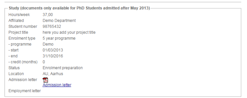
Figure 4: The 'Study' box under the 'my profile' at the 'Password and Profile' tab

This box contains various types of basic information about you and your enrolment and cannot be edited by you.